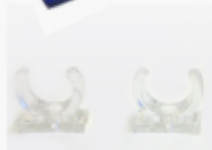
Clips and connectors